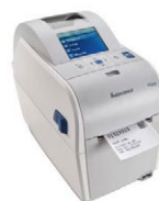
Honeywell PC23 Desktop Printer