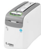
Zebra ZD510 Wristband Printer