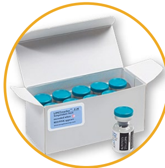
Specialty Healthcare Labels