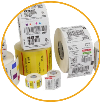
Labels and Tags