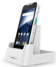
Datalogic Memor 10

Let us help you select the right technology to meet the daily needs of your staff, patients, and budget: