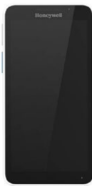
Honeywell CT30 XP