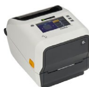
Zebra ZD621-HC Desktop Printer