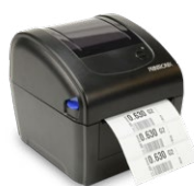
Printronix Wristband Printer