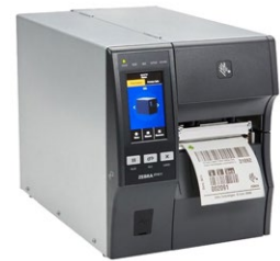
Zebra ZT411 Industrial Printer