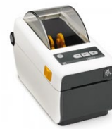
Zebra ZD411 Desktop Printer