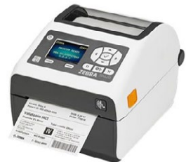
Zebra ZD621-HC Desktop Printer