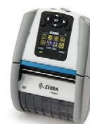
Zebra ZQ600-HC Mobile Printer